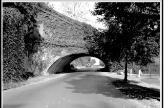
Yesler Trolley Bridge - 1930

In 1998 the Friends of Frink Park was formed by local residents to serve as stewards with the goal of restoring these woodlands to their former beauty.