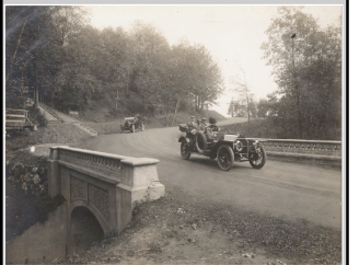
Waterfall Bridge - 1911